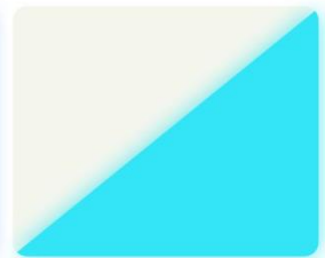
DL08 Glow In The Dark(Blue And Green)