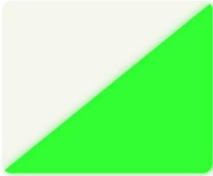
DL01 Glow In The Dark(Green)