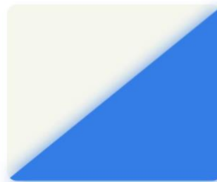
DL07 Glow In The Dark(Blue)