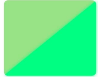
DL04 Glow In The Dark(Green)