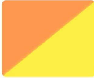
DL02 Glow In The Dark(Yellow)