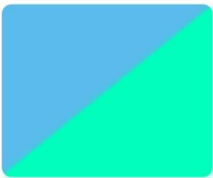
DL05 Glow In The Dark(Green)